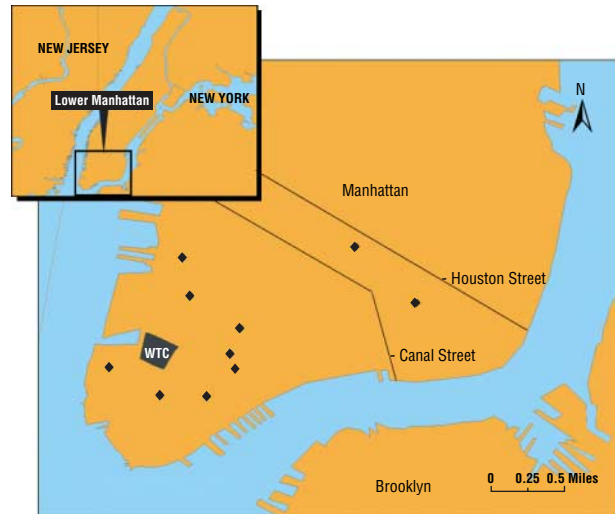
Figure 1. Approximate locations of preschool and day care sites (diamonds) in relation to the World Trade Center (WTC).

A total of 170 families with 200 children agreed to participate and signed informed consent forms for research. Among these 200 children were siblings who were excluded because they were older than 5 years (ie, not of preschool age) on the day of the WTC attacks, 22 whose families withdrew before completing the study, and 30 who had missing information on exposure status to WTC or other trauma events, leaving 116 children. Children included did not differ from those excluded on major demographic variables, such as age, sex, race, and socioeconomic status.