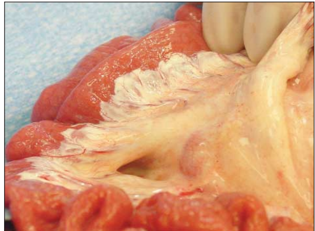
Figure 2. Operative image.