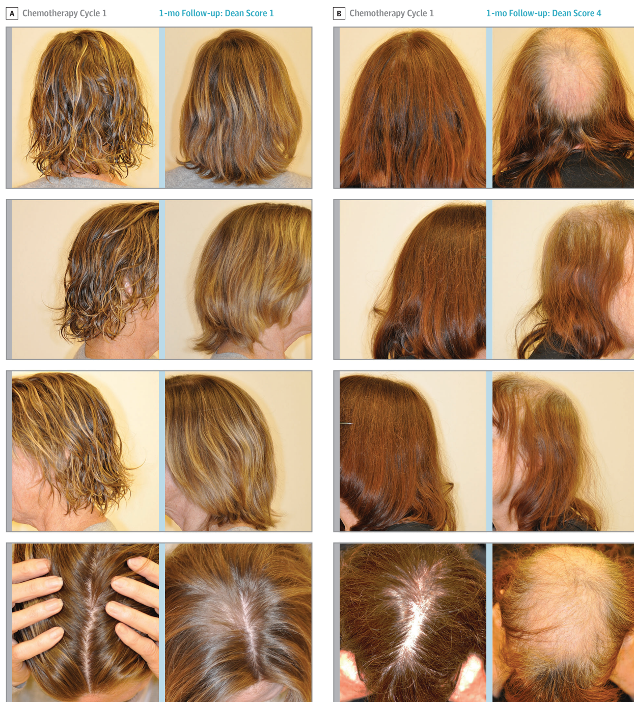
Figure 2. Photographic Results of 2 Patients Treated With Scalp Cooling

A, Patient photographs from 4 different angles before the start of chemotherapy cycle 1 (Dean score of 0; hair loss of 0%) and 1 month after completion of 4 cycles of chemotherapy with docetaxel (60 mg/m 2 ) and cyclophosphamide (600 mg/m 2 ) (Dean score of 1; hair loss >0%–≤25%). 8