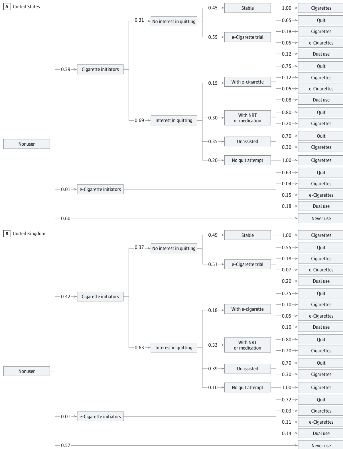
Figure 1. Decision Tree Model and Mean Transition Probabilities for the Base Case

See Table 1 for the associated standard errors. NRT indicates nicotine replacement therapy.