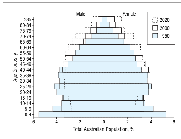
Figure 1. Population pyramids for Australia for 1950, 2000, and 2020.

Of 3271 urban residents recruited in 1992-1994, 2594 participants (79%) were reexamined in 1997-1999. In all, 2302 participants (89%) had cataract grading in at least